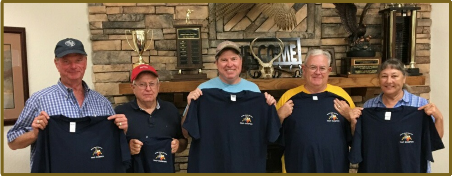
Winning Team - Benny and the Jets