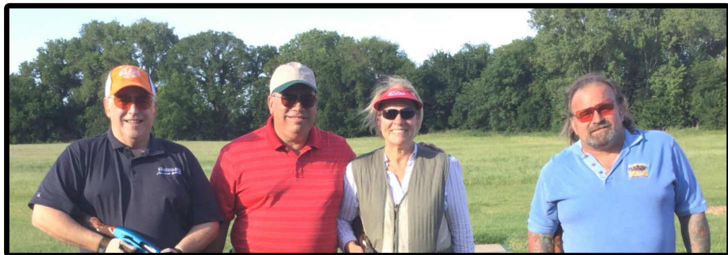
Team 12 - Clay's R Us