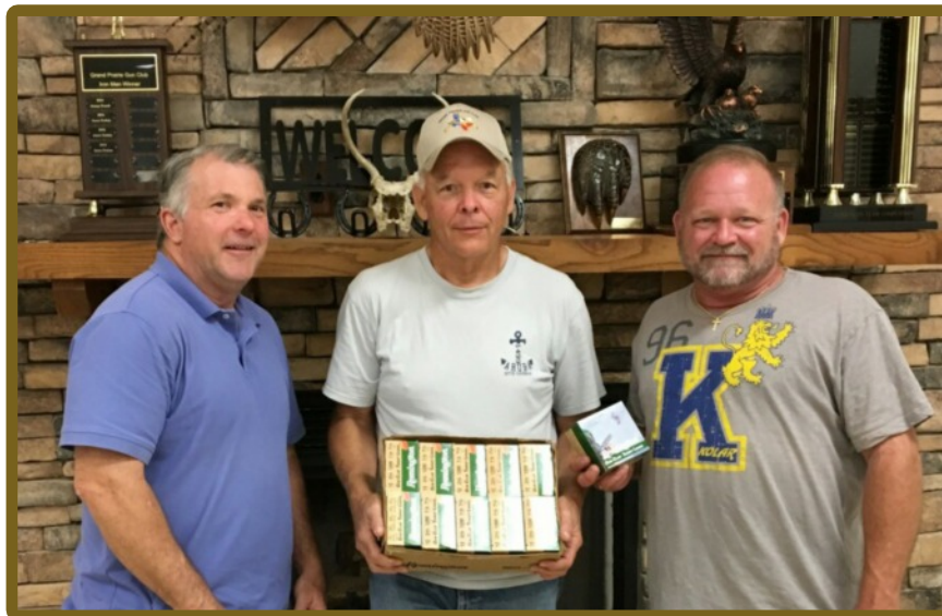
Second place team