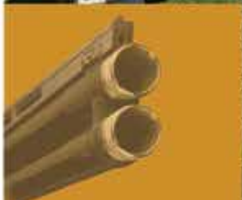
1 st 100 straight