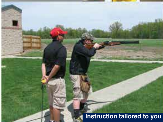
Instruction tailored to you