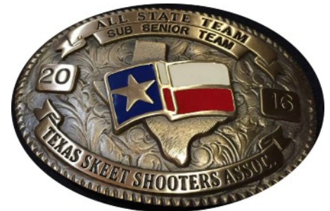
Sub Senior Team Buckle