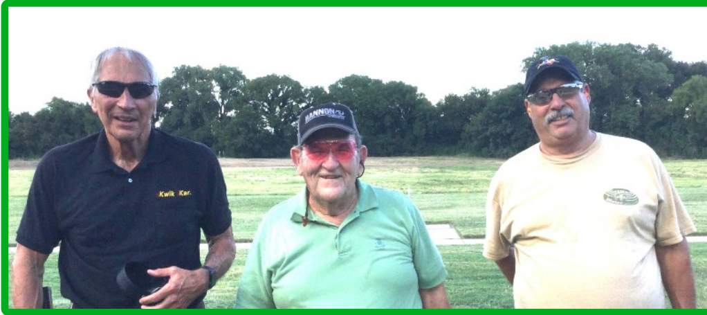
Dead N Deader