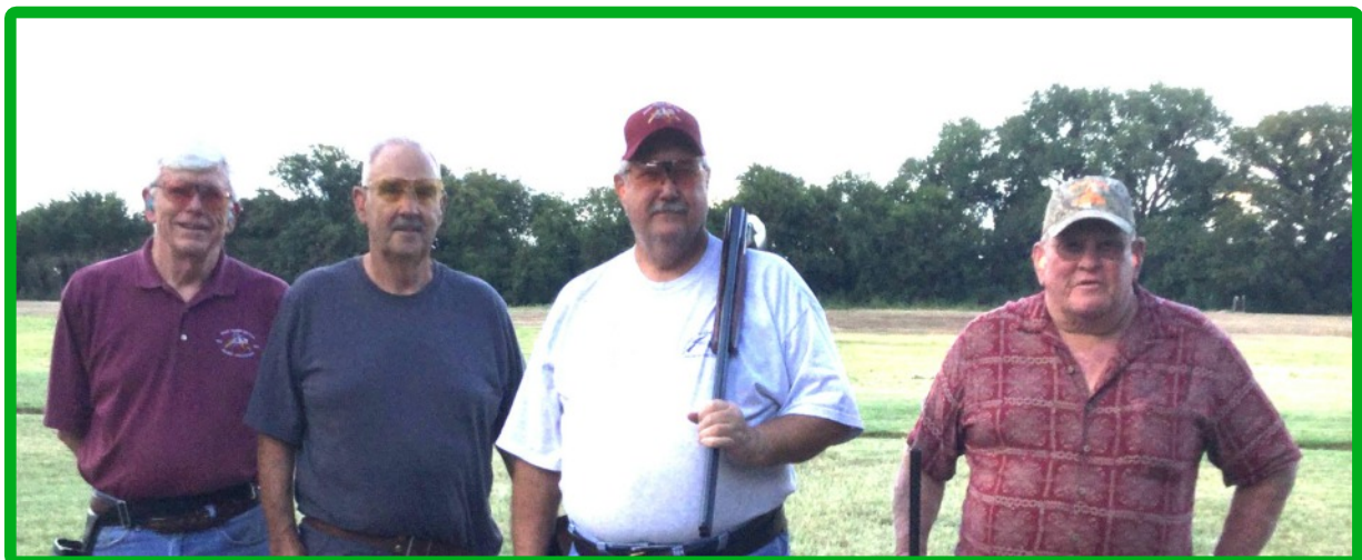
5 of a Kind