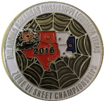
Zone VI Skeet Pin