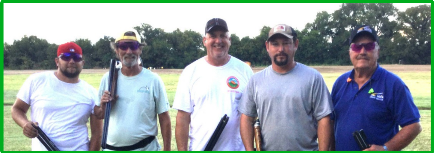
3 on 8