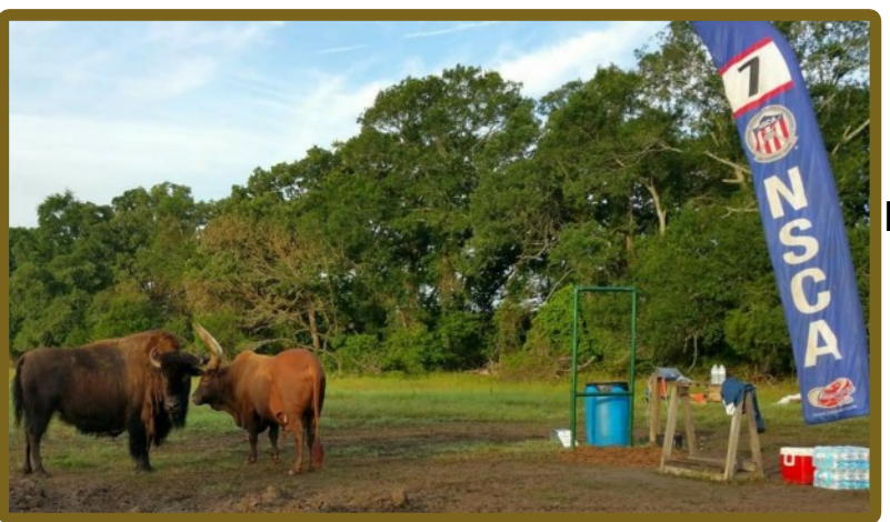
Blue Course before the rains