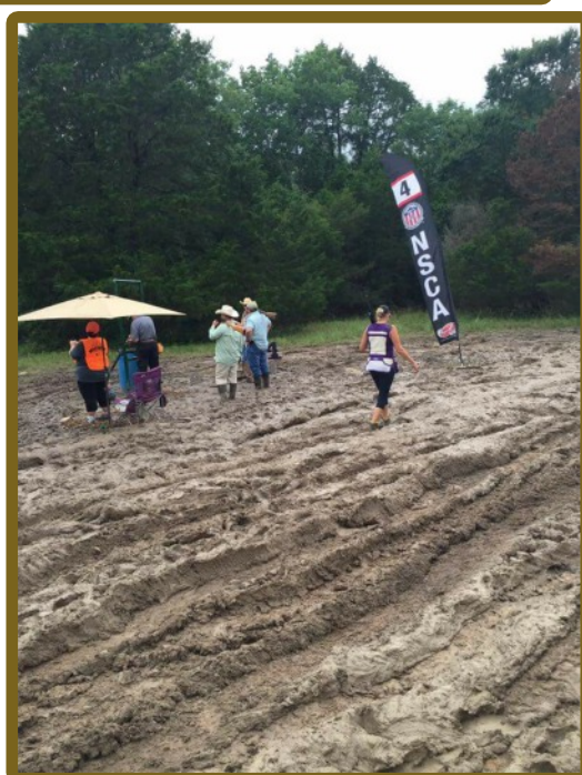
Blue course after the rains