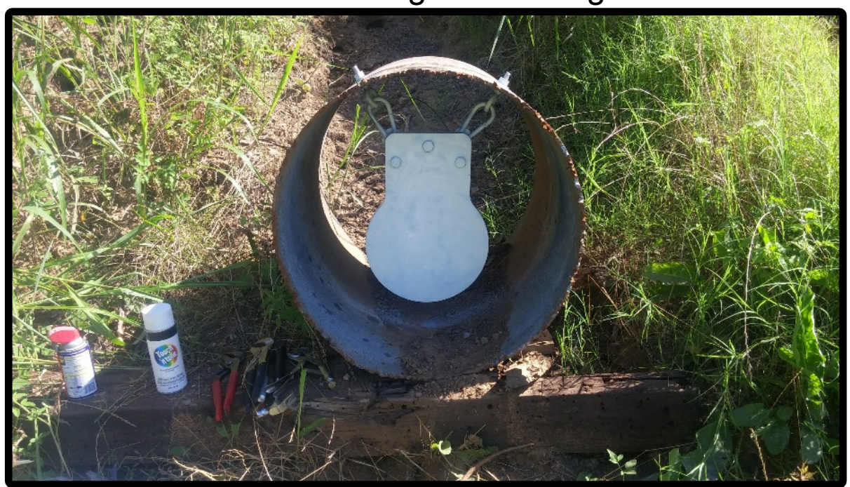
The new gong -- "heavy duty" 3/4" ballistic plate rated for 50 BMG – hopefully this one never needs replacing. Thanks to Craig Neill for hanging the gong and re-positioning the pipe