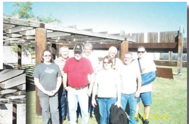
October 25th shooters; winners at left