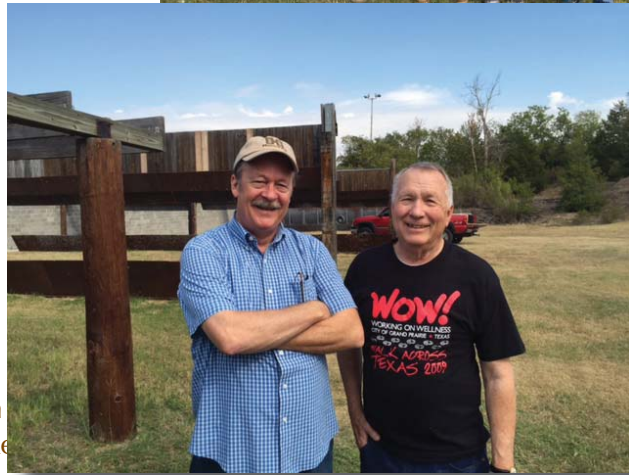
September 27th winners; shooters at top