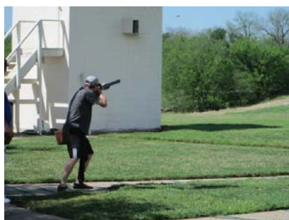
Foshea on the bird