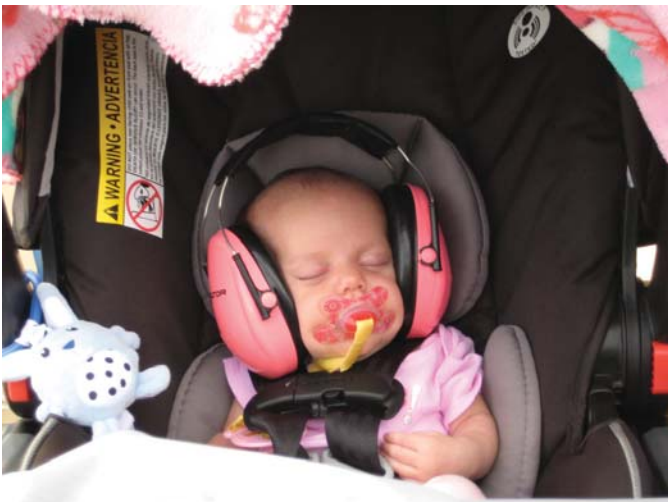
Six-week old doesn't seem to be bothered at all!