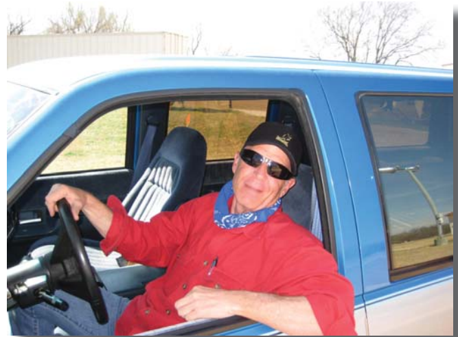
Members enjoying the great 1 day weather on the skeet range