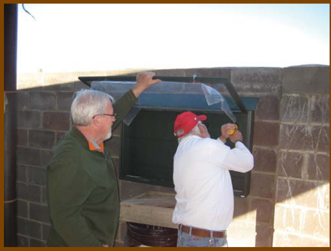
Long time project finally finished – beautiful new all weather bulletin boards for the rifle and pistol ranges