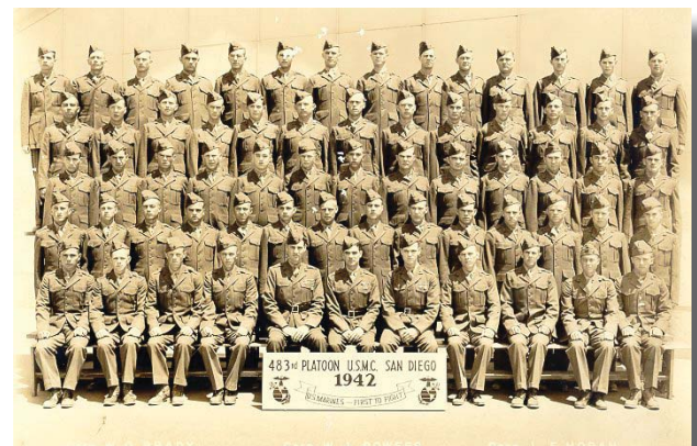
My dad is top row, third from the left.