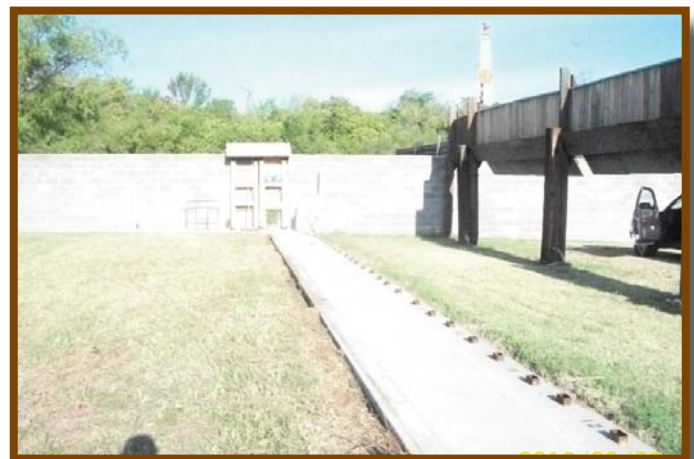
This shows what it looked like 9 AM