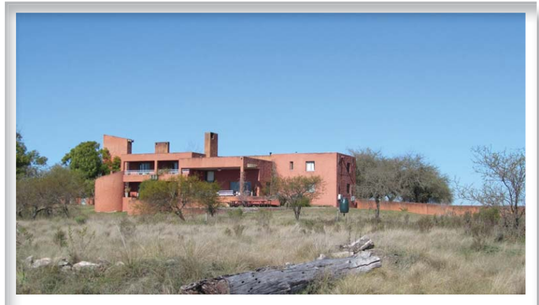
San Cirilo Lodge where we stayed, south of the city of Paysandu on the western side of Uruguay

In Uruguay, as in Argentina, the over population of doves is a menace to agriculture, and hence, the doves are unprotected. There is no closed season and no bag limits for doves. The doves flew in a nearly continuous wave with seldom a lull in activity. The dove hunting was fast and intense and extremely high volume. On the first day of dove hunting, I shot 22 boxes of ammunition in approximately 2 hours. I happened to be at a good location. Subsequent days of dove hunting were also high volume, but not nearly as intense for me. The dove hunting here in Uruguay was better with more action than I remember Argentina to be on a previous trip. We all used 20 gauge shotguns