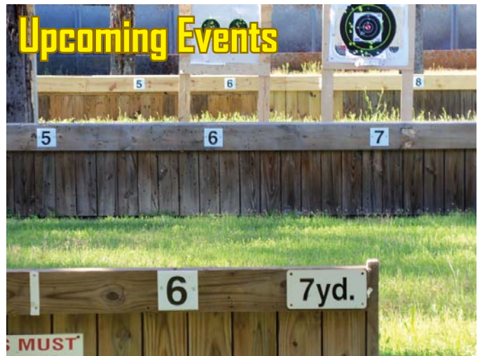
New Lane Numbers on pistol range by Vic Paladini

Grand Prairie Education Committee 972-641-9940 (leave message)