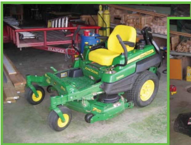
New John Deere O-turn mower and chair project pieces