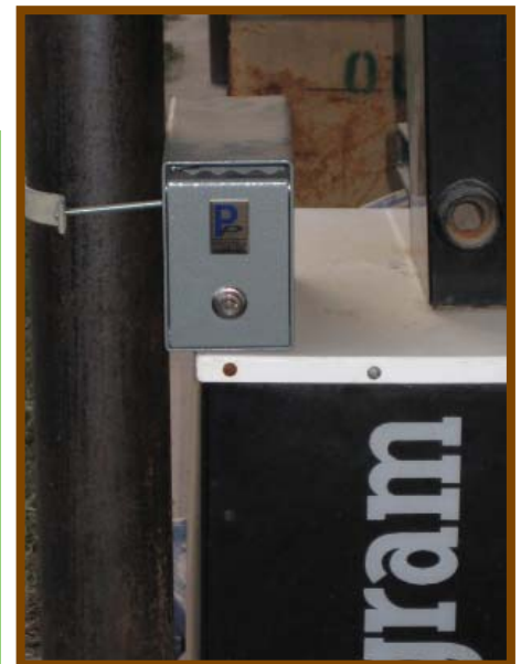
Donation box on rifle range