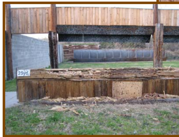
25 Yd pistol range - please adjust targets