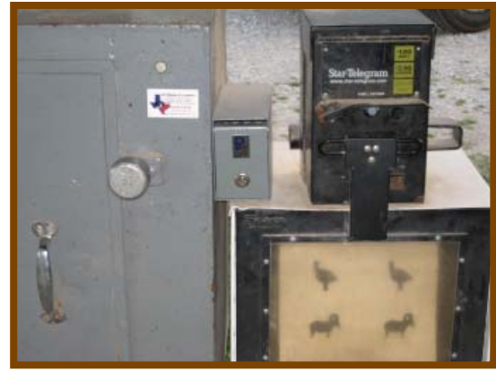
Donation box on pistol range

Participants should remember that this is a member operated club with no paid employees. Everyone should do their part in Scoring, Refereeing, Set-up, Clean-up, Loading the Machines, and Breaking Down of the fields each night. This especially means picking up your shells before leaving the field. People who arrive late should do more in the clean-up each night due to the fact that the early arrivals probably participated in the set-up of the field.