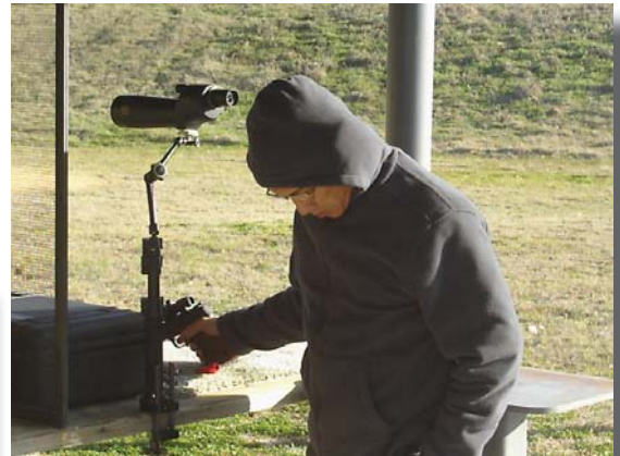
Concentration is the secret to success