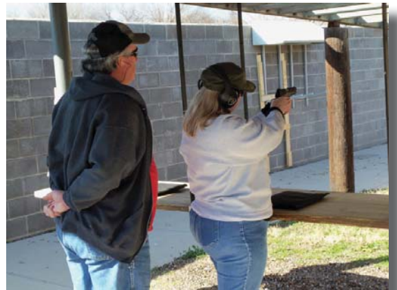
Working on getting a good grouping