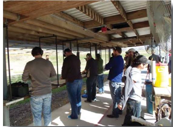
Public Day at the pistol range