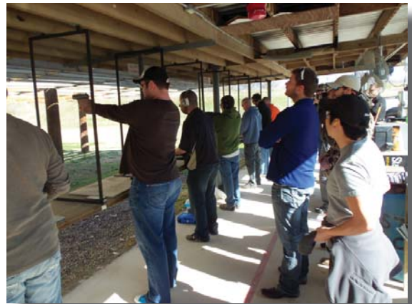
Waiting their turn