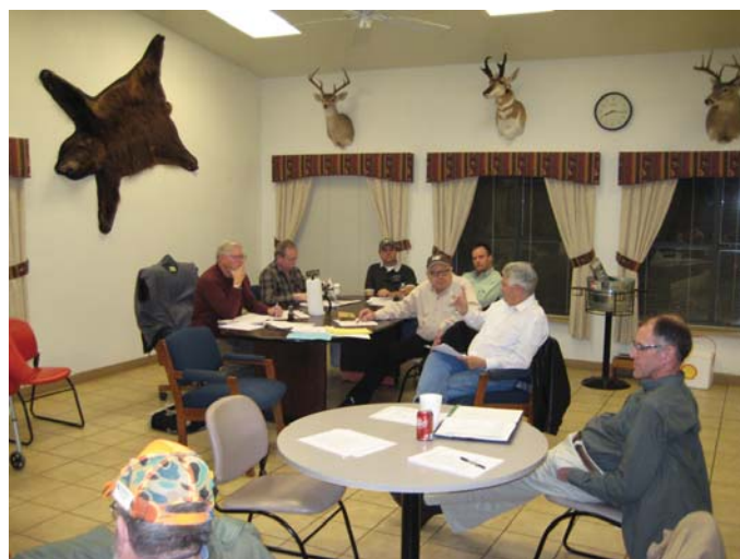
GPGC Annual Board Meeting