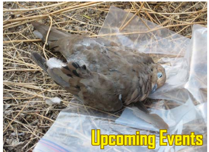
First day of Dove Season