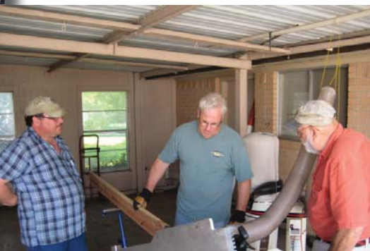
Planing wood at Charles' shop