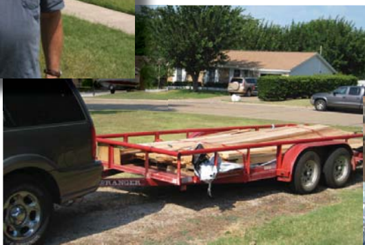
Trailer load of Cyprus to become new chairs