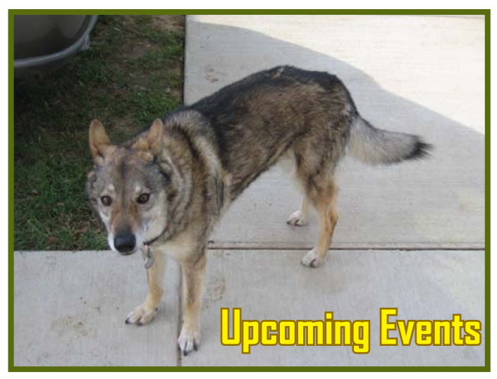
Pet coyote seen on the skeet fields

Grand Prairie Education Committee 972-641-9940 (leave message)