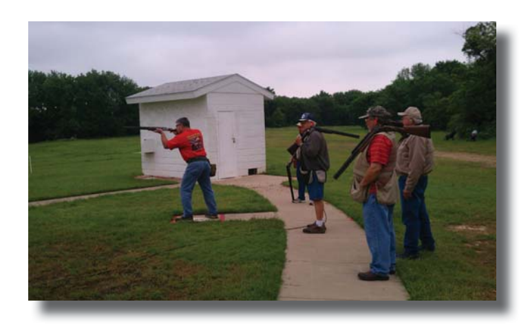
Duh Boys, Russ shooting