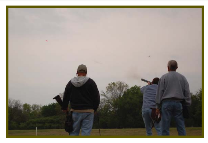
It might be hard to see, but the streak of grey heading towards the bird is the shot cloud and wad!