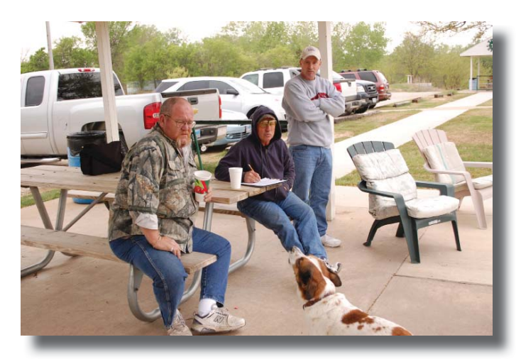
Buddy's opinion seemed to settle the debate