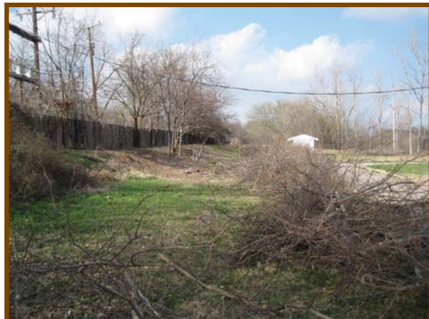
Brush to be chipped