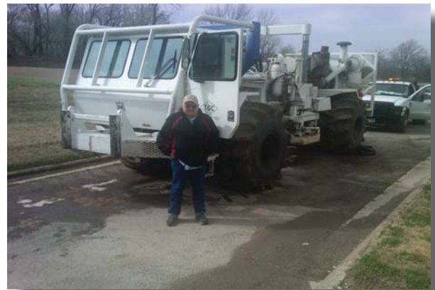
The seismic testing vibratory truck broke a hydraulic line while thumping the gun club Monday.