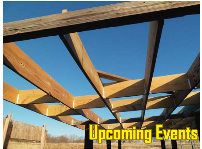
Pistol Range Work Day

Grand Prairie Education Committee 972-641-9940 (leave message)