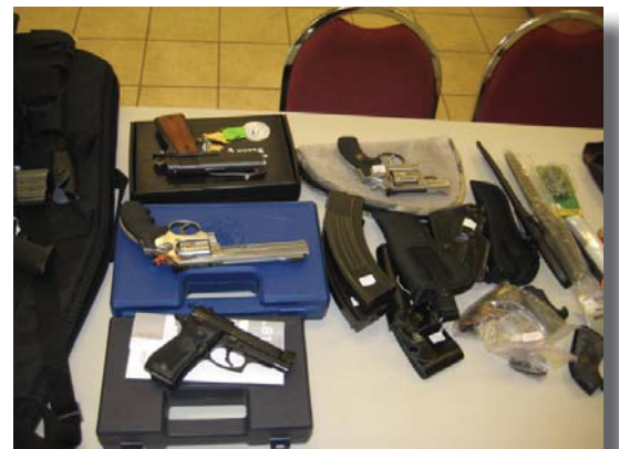
Misc. for sale