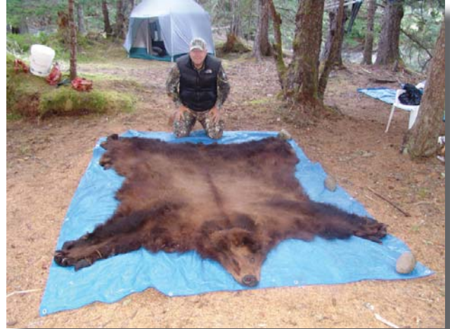
The prize: 9-ft. Brown bear weighing over 1,100 lbs.