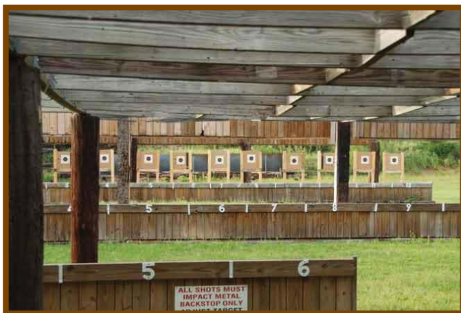
Bullseye Shoot - Shooters' view of the targets