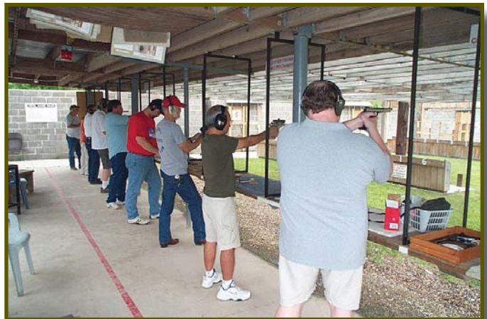
The whole firing line.