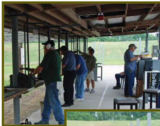
Practice time before the shoot