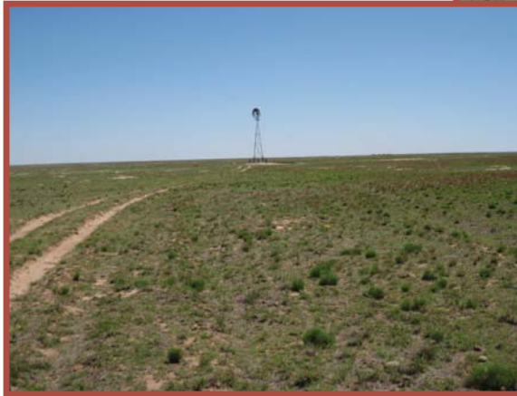
Prairie dog town