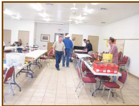
More tables inside

Article & photographs: courtesy of Van Elliott - velliott2105@msn.com