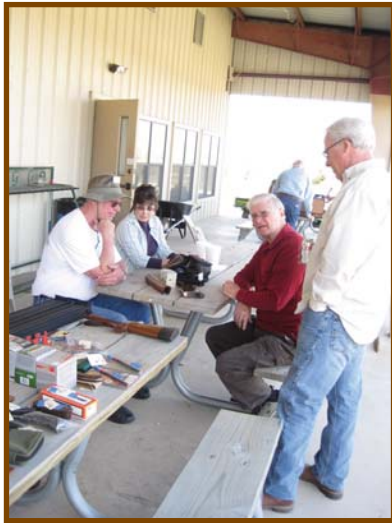
Serious negotiation underway

several emails and telephone conversation were made to stir the pot a bit more. This was a club member's and guest only affair to see how well the idea would be received by the membership. Apparently it was a big hit! One new member said he was so pleased to see everything running smooth and there were no signs of tempers or bad words being exchanged. It was a very pleasant atmosphere with serious negotiations and