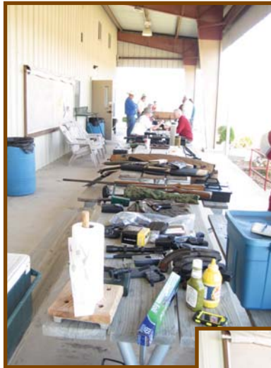
Swap Meet tables ready for customers

happy faces seeing stuff they thought they could not live without. Most of the people who had tables set up were