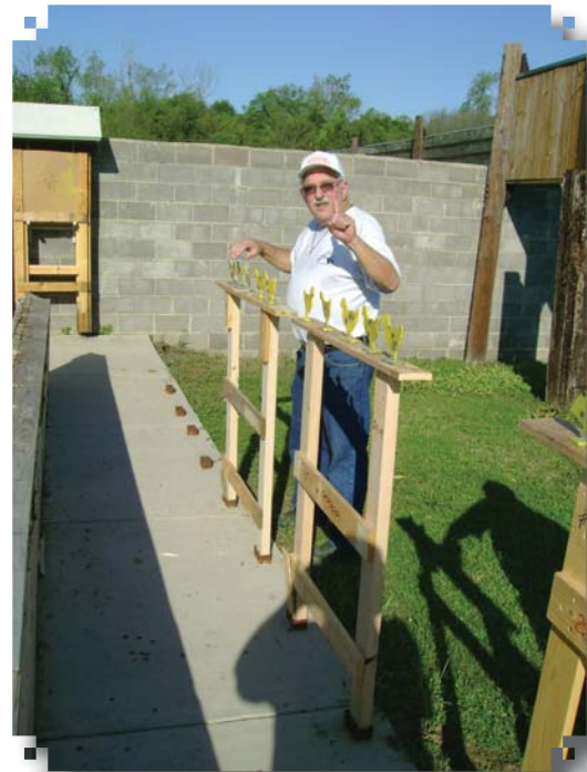
New way to achieve shooting perfection: drill a hole in your finger before shooting!