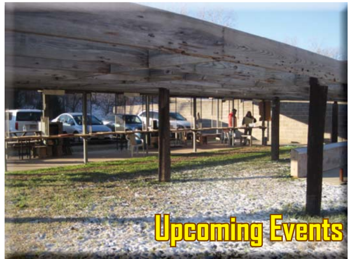
Christmas snow still on ground for 12-26 shoot