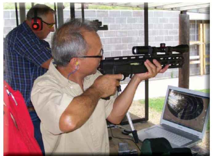
Hoa with the Terminator pistol