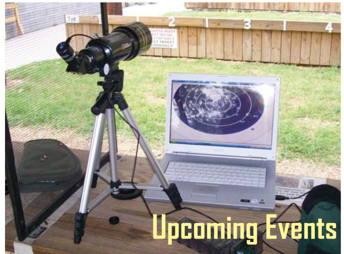
HiTech spotting scope