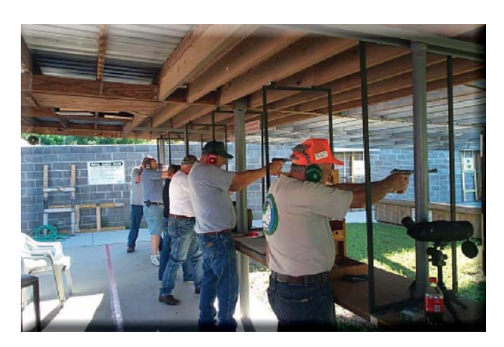
Timed fire for the second relay