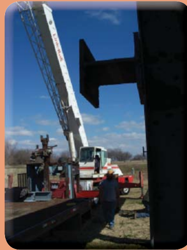
Donny Penwell's crane make lifting much easier, thanks Donny!