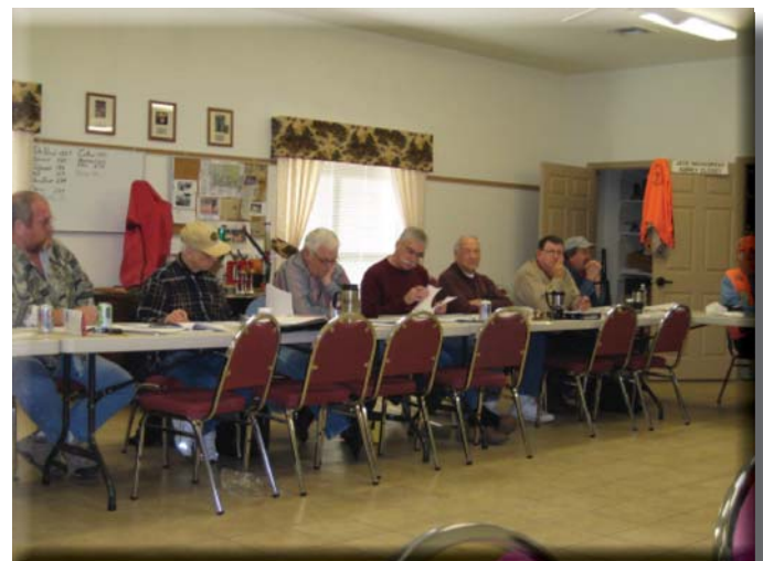
Range officer training class

Look forward to seeing everyone on the rifle range.