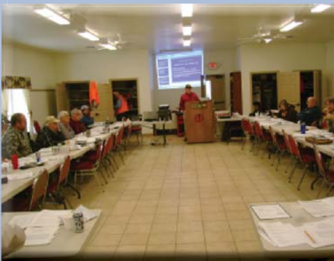
R O Trainees hard at work, 01 31 09