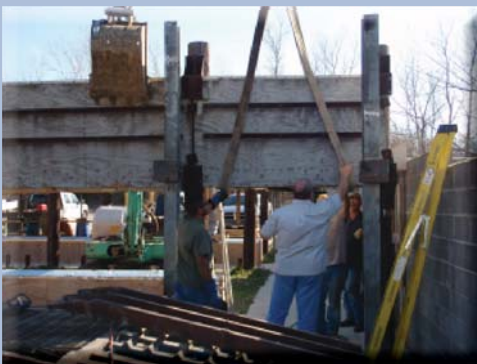
Dale giving instructions