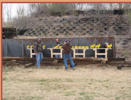
Setting 50-yd. targets