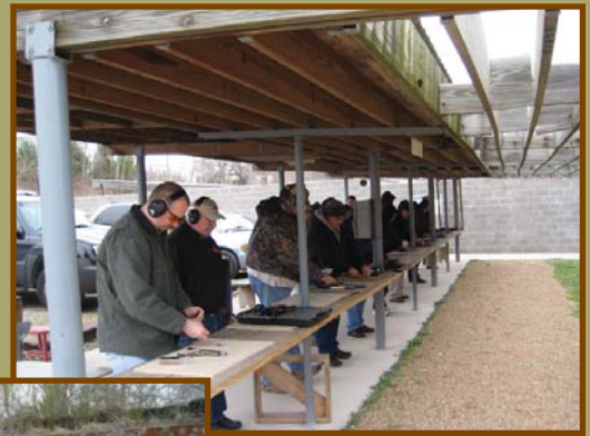
A full line of shooters