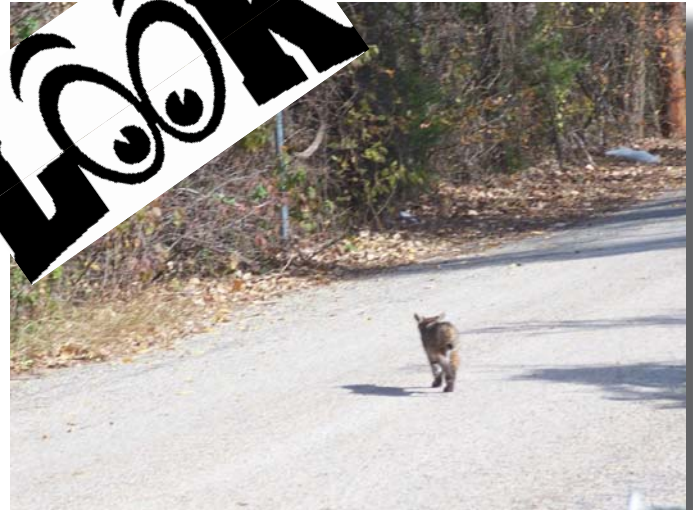
Bobcat walking near the gun club