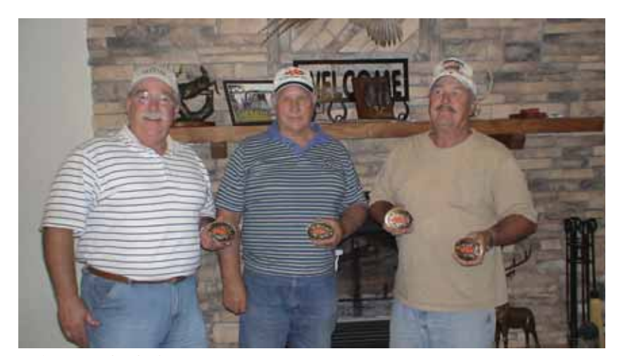
Leftovers, Third Place