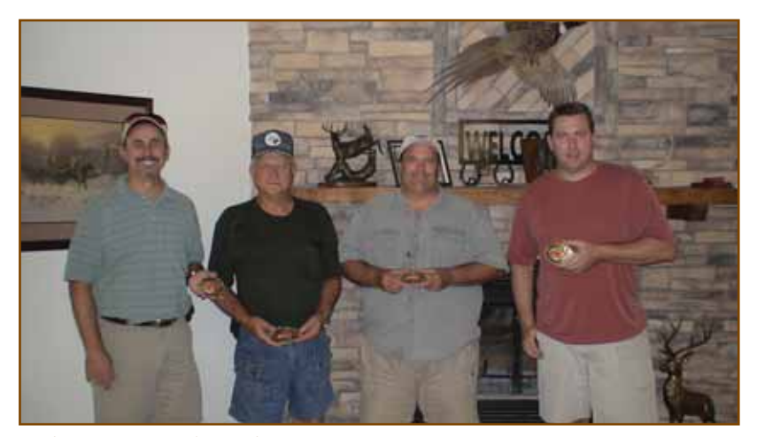
Duh Boys, First Place Champs