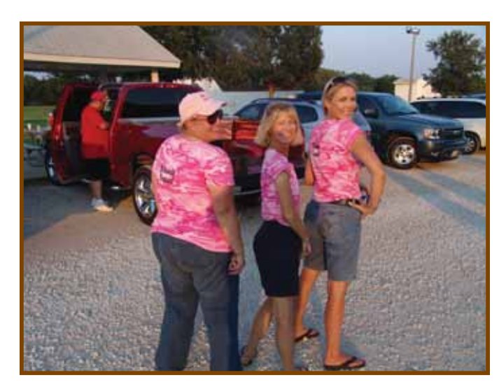
World Warmup Skeet Shoot