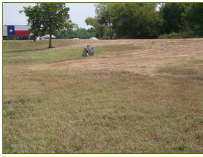
What is missing???

Be Courteous! Reload the houses when you finish shooting. Pick up your hulls - clean up the area a little - use trash cans!