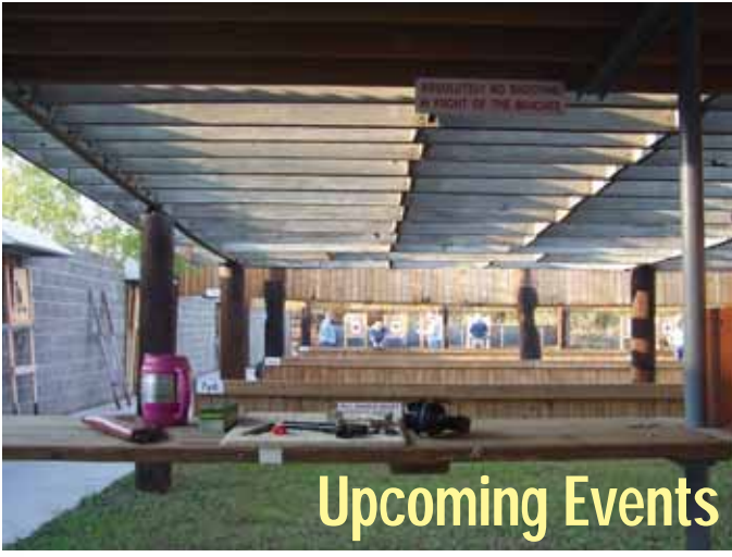
Bullseye Pistol Shoot