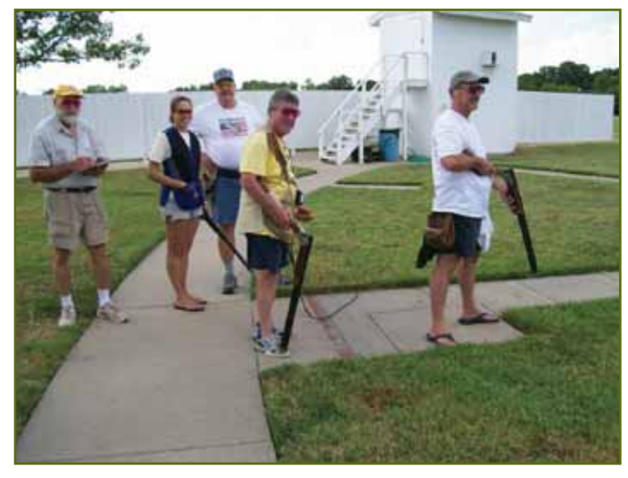
Just act natural. No DON'T pose...!