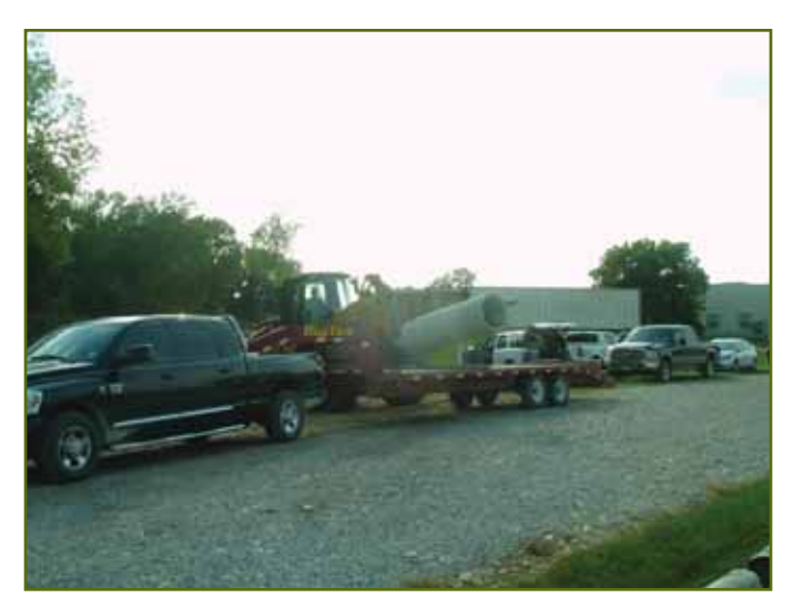
Shane Cole delivering more pipe