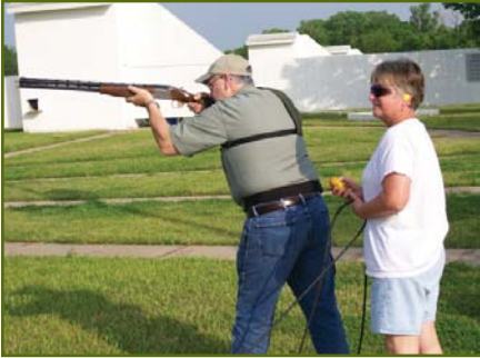
Keep both eyes open and swing smoothly