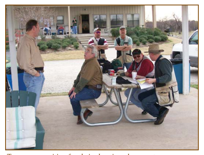
Trap group waiting for their shooting placement