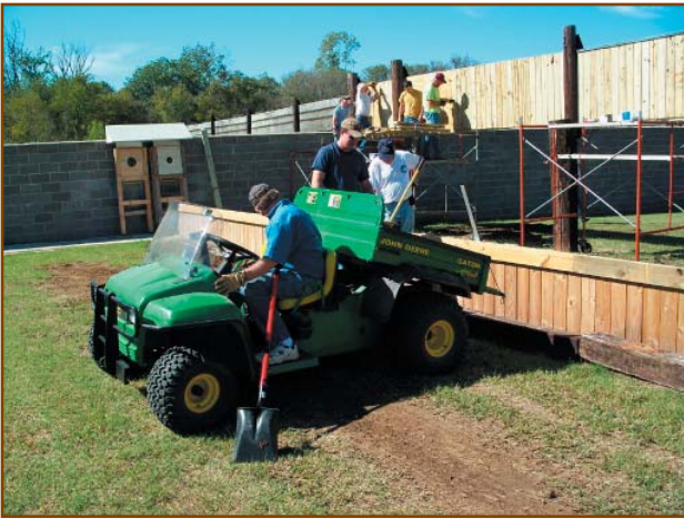
Club tractor hauling and spreading