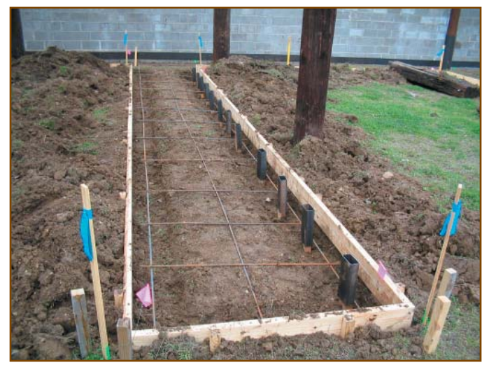
Pistol range sidewalk and target line formed (new 7-yd. line