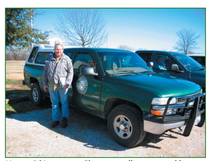
Hunter Ed Instructors Class was well represented by TP&W