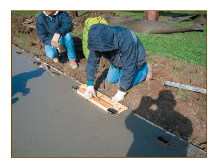
Aligning the target frame sleeves