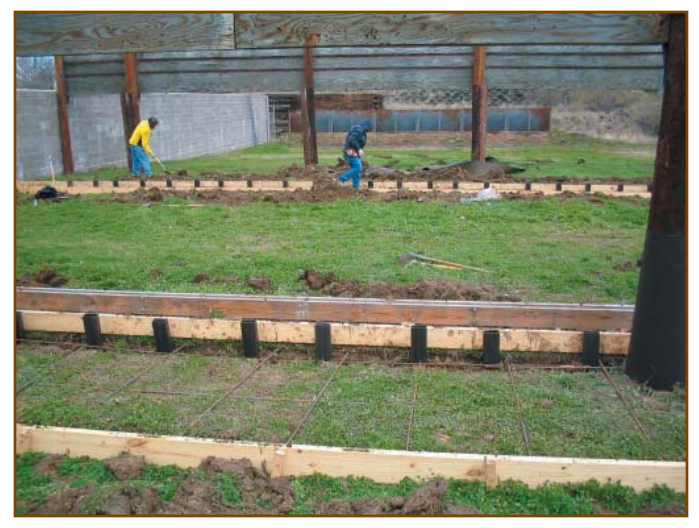
Pistol range 15-yd. and 25-yd. lines