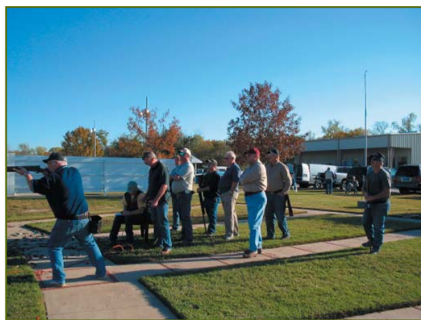
The 3-Bird Flush was very popular with 66 entries