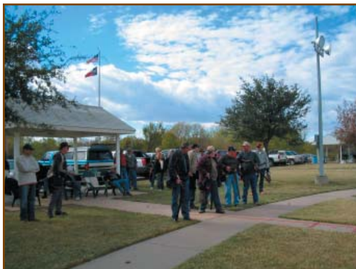
Wolf Chase winners

Please help in keeping our Club secure. Thank you!