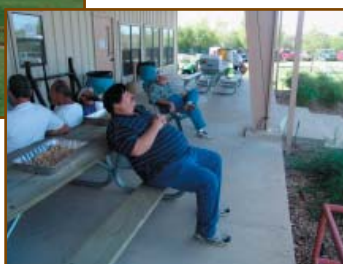
Unsung heroes taking a break