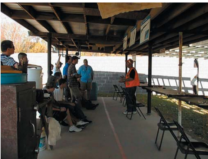
Hunter Ed at the pistol range