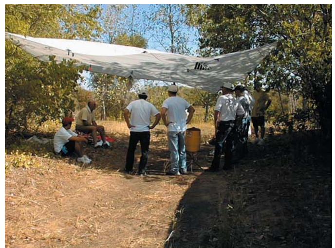
Shade and water stop

Grand Prairie Gun Club P.O. Box 530274 Grand Prairie, TX 75053-0274