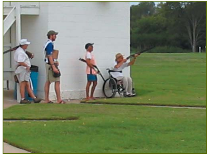
Registered Pre World Warmup