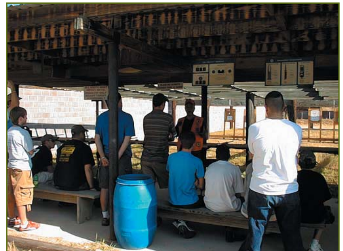
Pistol range instruction