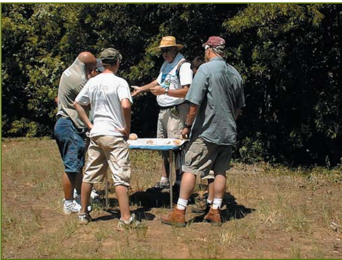
"Nothing up my sleeves..."