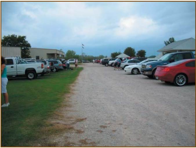
Full house at the registered shoot