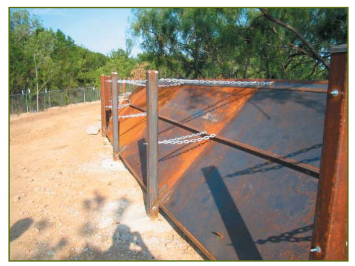
Ricochet catcher 6' high x 220 ft. long