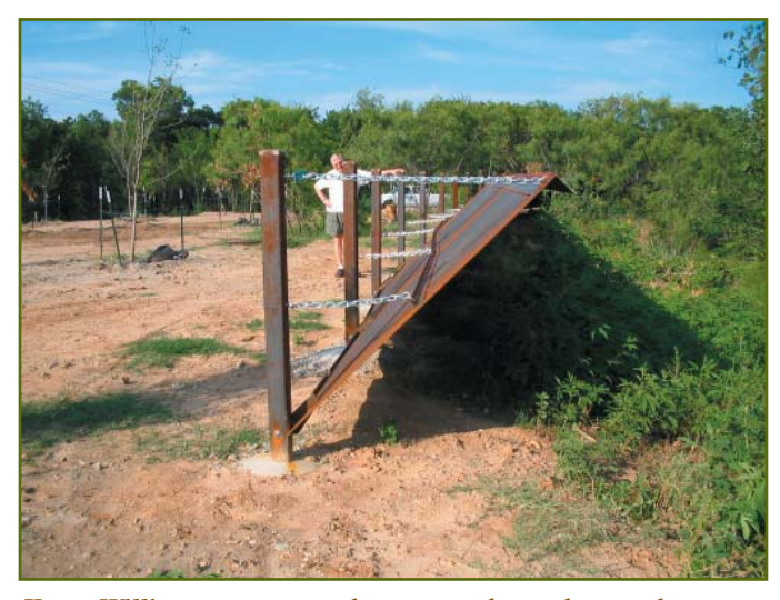
Kerry Williams inspecting the new steel ricochet catcher behind the rifle range