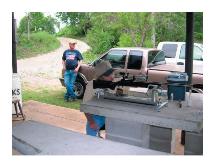
May ARA Shoot