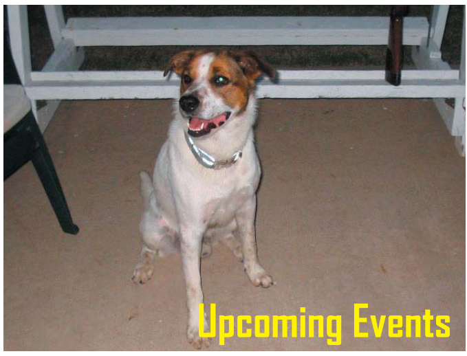
Buddy Wills - club mascot

Grand Prairie Education Committee 972-641-9940 (leave message)