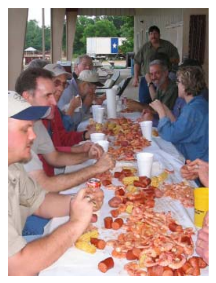
Eating good at the Gun Club!