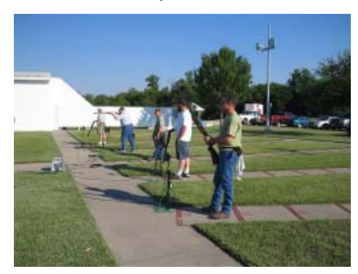
Monday afternoon trap shooters