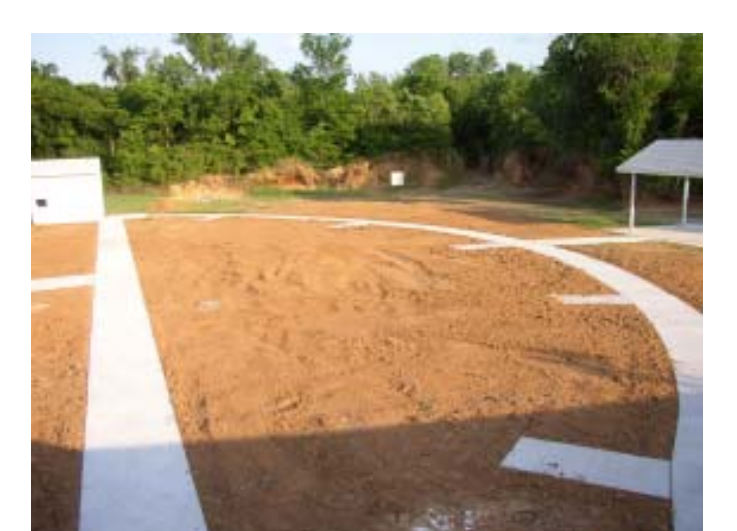
New skeet field is almost ready.