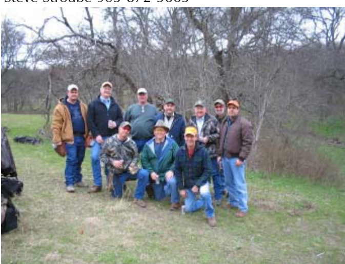
Tower Pheasant Team

After an outstanding bar-b-que lunch we each picked up 7 cleaned and packaged pheasants and headed home. A great shoot and fun packed morning an hour from home for $195 and the service is 4 star. Check the site out: www.uplandbird.com or call Steve Stroube 903-872-5663